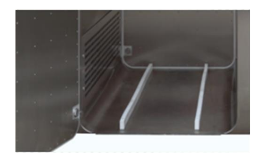
Figure 1. BioPass<sup>™</sup> floor guides

As the trolleys are relatively large and heavy, it was important that the carts do not have to be manoeuvred over a ramp or step. As Esco's BioPass mounts straight to the client floor without any entrenchment needed (no ramps or steps), no manipulations to the standard entry design were needed.